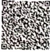
Offline QR Code

Unique Registration No.: WGNP/2023/143181