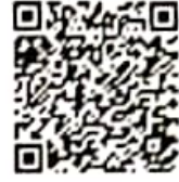
Online QR Code